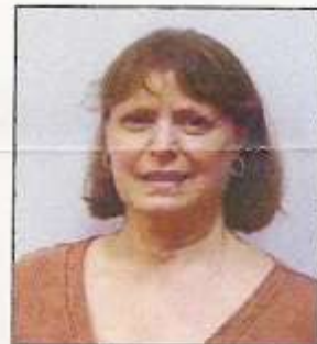
BECKY PARKS "San Juan Capistrano" 18" x 24" oils