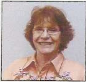
JUDY DUNN ZIPKES "Portrait" 16" x 12" - oils