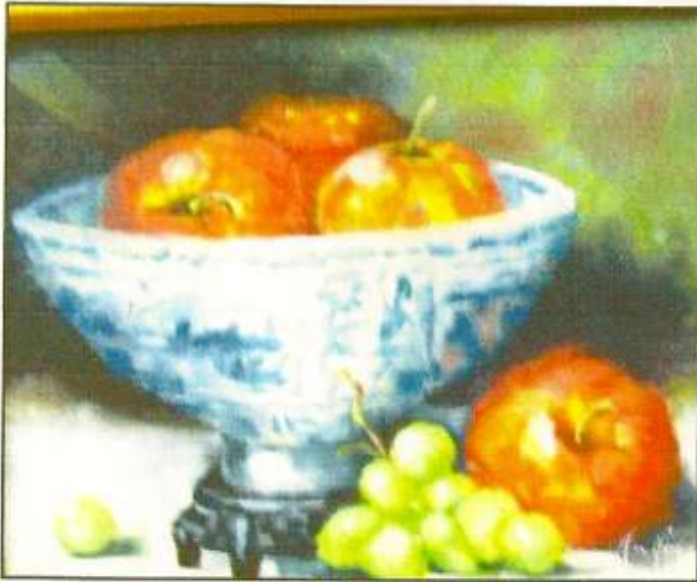
FIRST PLACE Ann Rogers