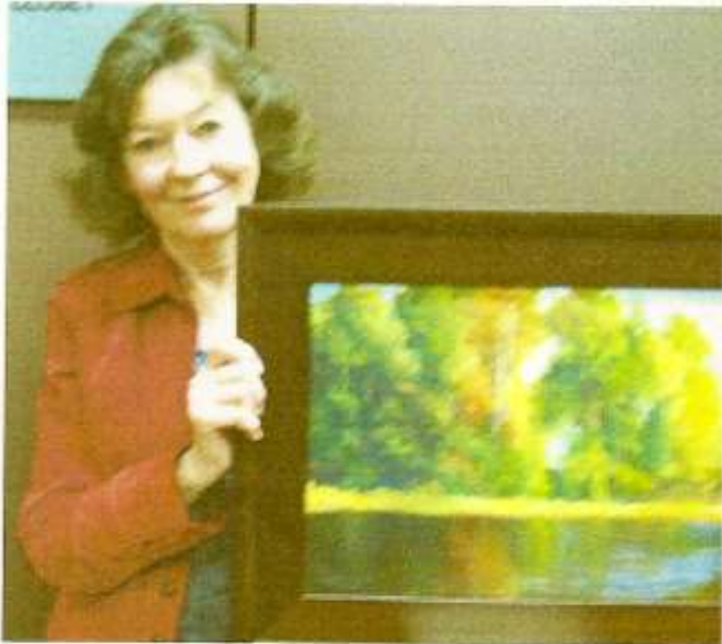
FIRST PLACE DONNA HERBENER Jones Lake 12" x 16" oil