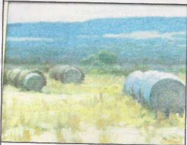
SECOND PLACE BOB O'BRIAN "Last Year's Bales" 9 x 12 oil